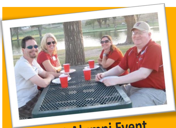
Past Alumni Event

Although Tech's football season may not have been spectacular, APO was there to support the team and do a great job with program sales.